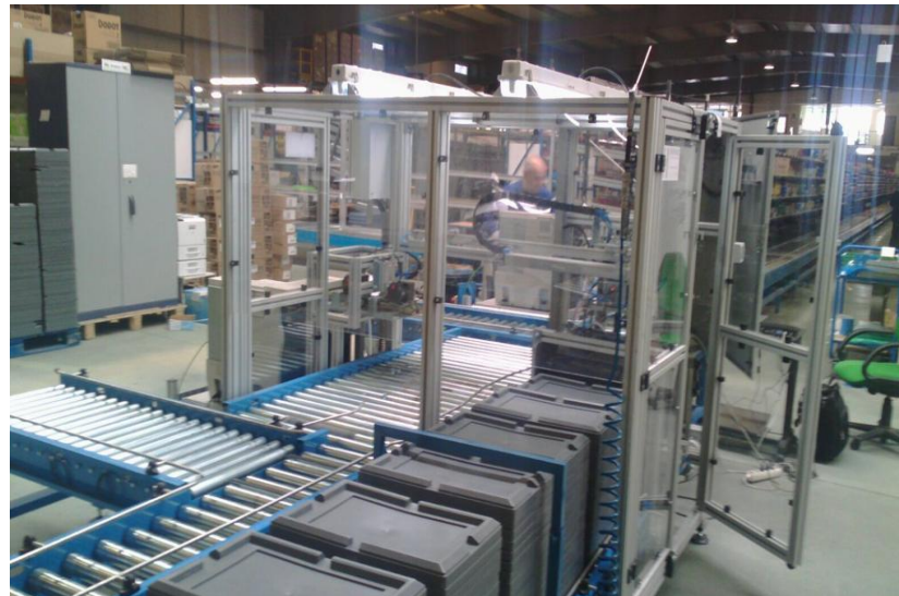
High capacity cover machine for crates