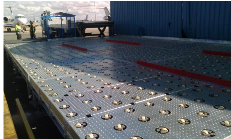
Air Cargo Handling Systems