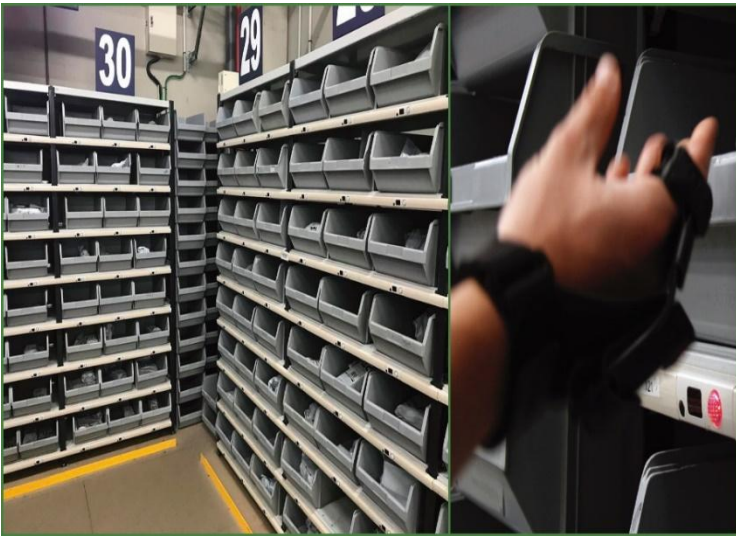
Pick To Light Systems