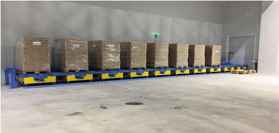
Conveyor and lifters for pallets