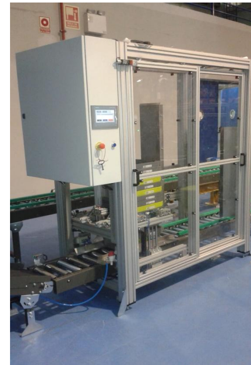
High capacities stackers and destackers